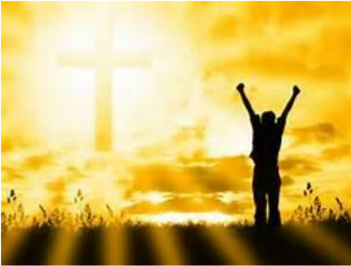
At the Foot of the Cross, author unknown

At the foot of the cross, I lay it all down Everything in my life, that's hidden deep inside I give it away, for my Savior to heal These fears that I have, that I've buried for years At the feet of Jesus, my heart pours out tears As I kneel and pray, my thoughts become clear And I finally see what's so very dear