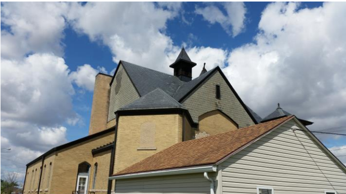
High wind storm damage to the cooper upper copula of the tallest steeple