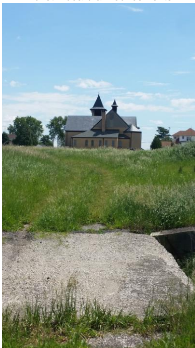
Springtime back view of Salem from old bridge

We will try to unpack the full meaning of the Last Supper and learn how to engage it in deep celebration, commemorating Jesus' redemptive work on our behalf.