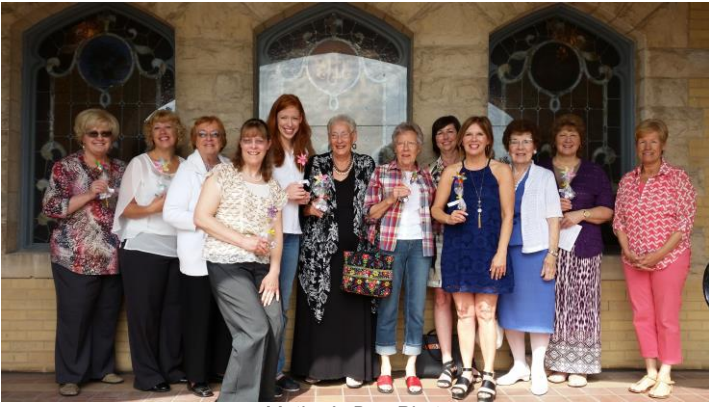
Mother's Day Photo