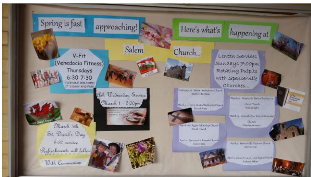
Bulletin board announcements