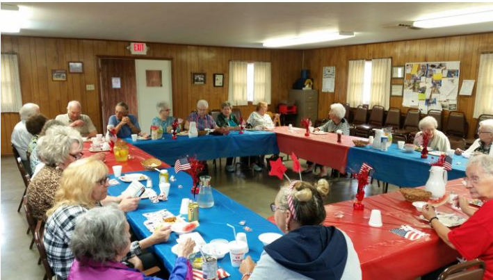
May Senior Luncheon with Bingo games