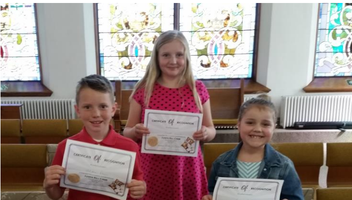
Youth Bells certificate awarded to 10 youth