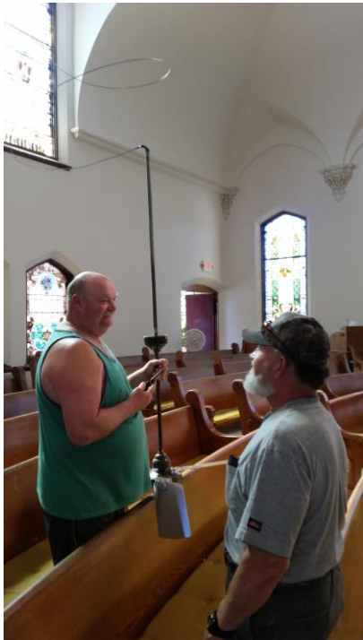
Trustees replacing the old sanctuary ceiling fans