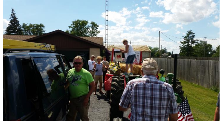
Spencerville Summerfest Salem Float building