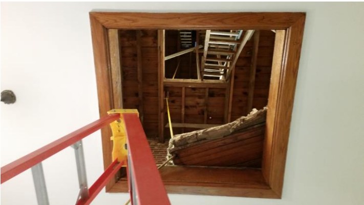
Looking upward, the Bell tower access climbed by Trustees for repair work