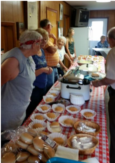
Some of the Ice Cream Social food