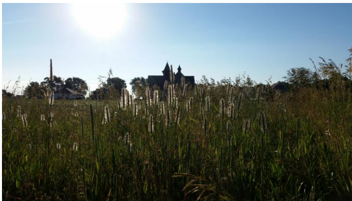
Salem from the back field