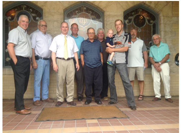
Father's Day June 18