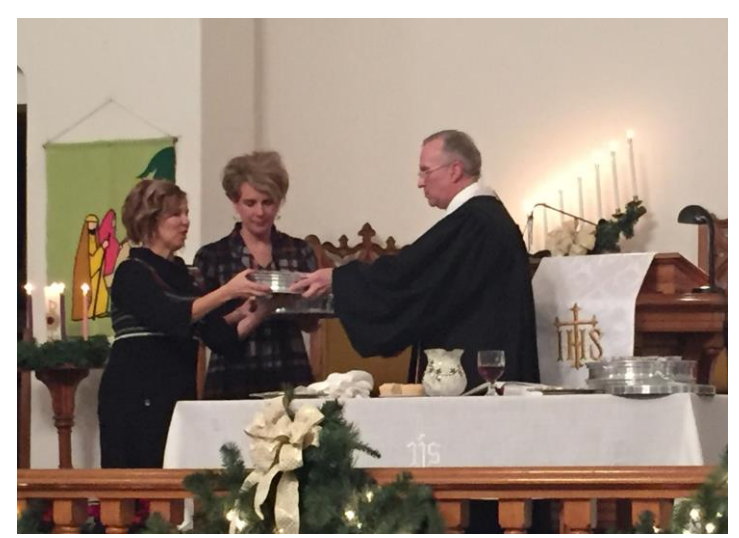
Christmas Eve Communion