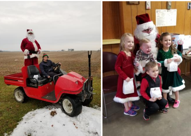
St. Nick vist at the Venedocia Lions Club

Needed to Date: $102,502.00 Received to Date: $104,469.86