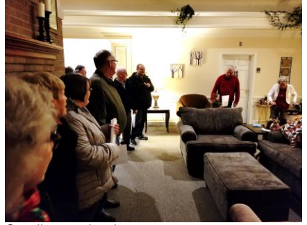
Caroling to shut-ins