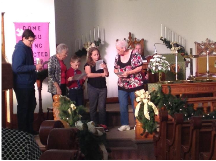
Lighting the Advent Candles