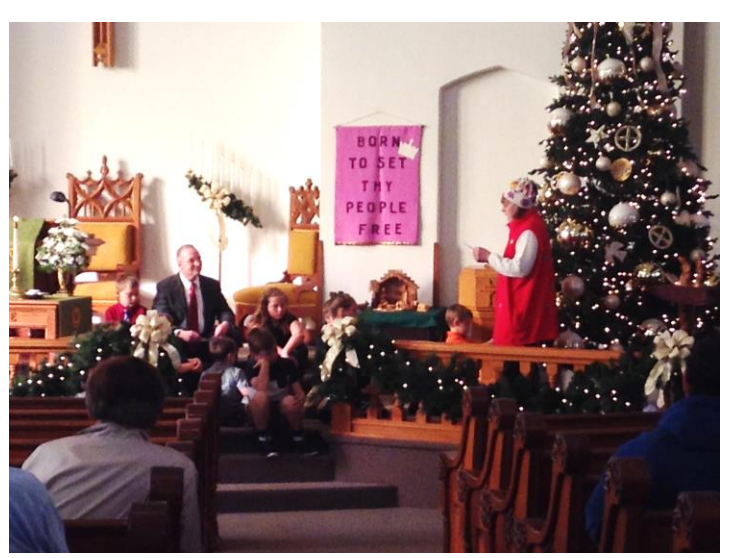
Sandy character reading the Christ story