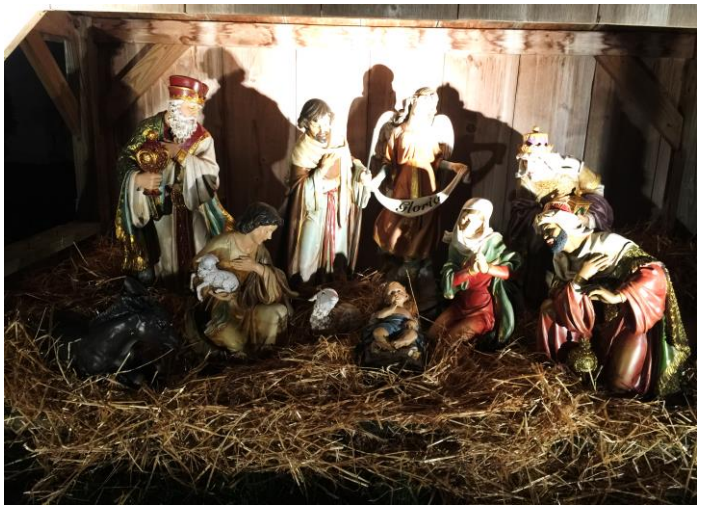
An anonymous donor replaced our plastic lighted one with a beautiful ceramic scene.