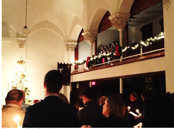
Christmas Eve Candlelight service