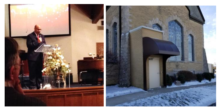
The Van Wert Ministerial Association Community Event / New elevator awning