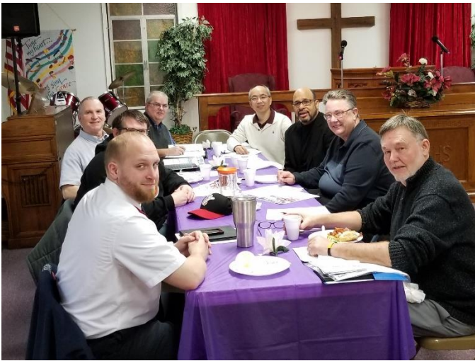
Van Wert Ministerial Association