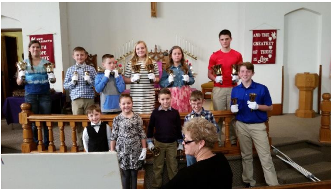
Junior Bell Choir practice