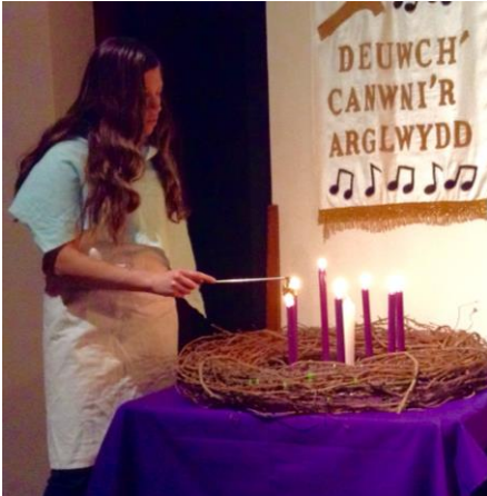
Extinguishing the Lenten Candle skit

Salem Presbyterian Church P.O. Box 678 Venedocia, Ohio 45894