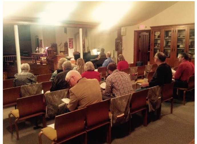
Ash Wednesday informal service