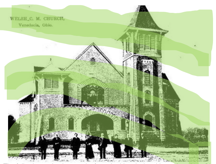
The following series is a reprint from the historical archives of an Ohio City newspaper unnamed and undated.

The Salem Presbyterian Church of Venedocia has an interesting and inspiring heritage. Founded by hardy, God-fearing pioneers it continues after one hundred and twenty-eight years to be the religious inspiration for the community.