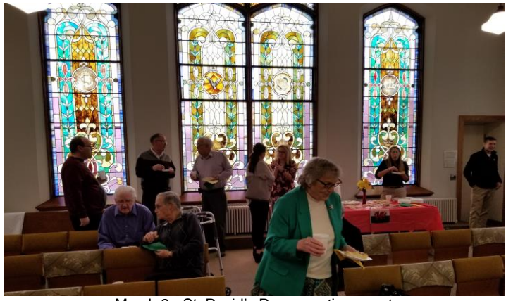
March 3 - St. David's Day reception event