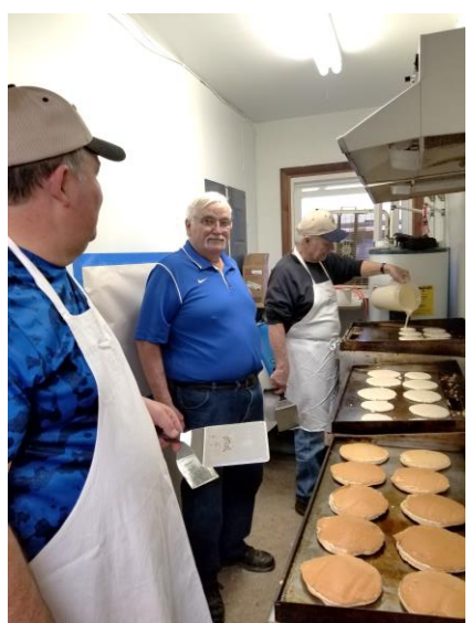
March 23 Lions Pancake Breakfast Event