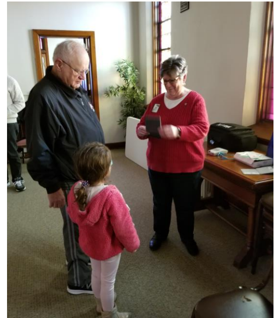
March 23 - Free eye exams at Salem given to preschoolers with the Venedocia Lions Club