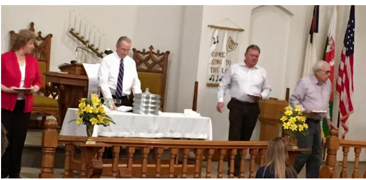
March 3 - Communion on St. David's Day