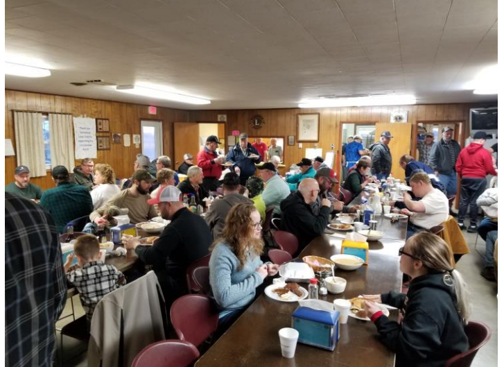
March 23 - Venedocia Sausage Pancake Day at the Lions Club