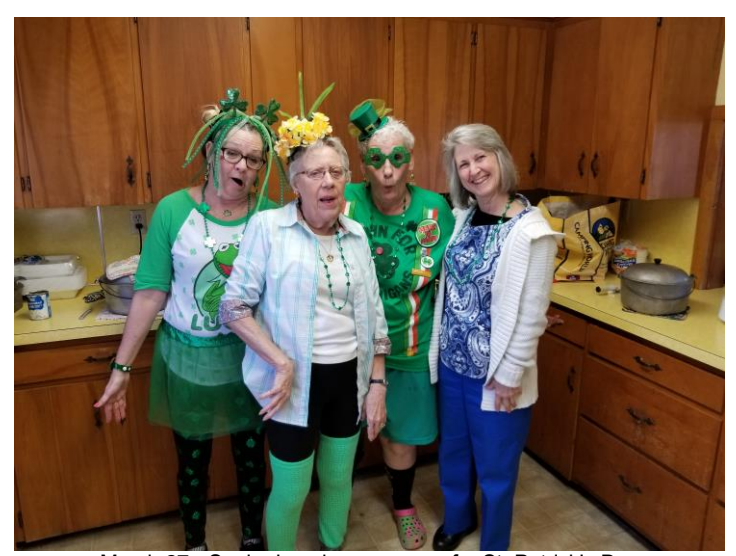
March 27 - Senior Luncheon servers for St. Patrick's Day