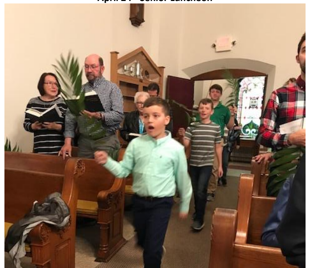
Palm Sunday Procession