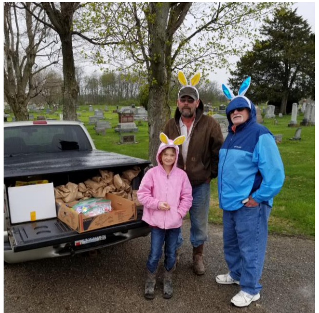
Rained out Egg Hunt passing candy to car windows