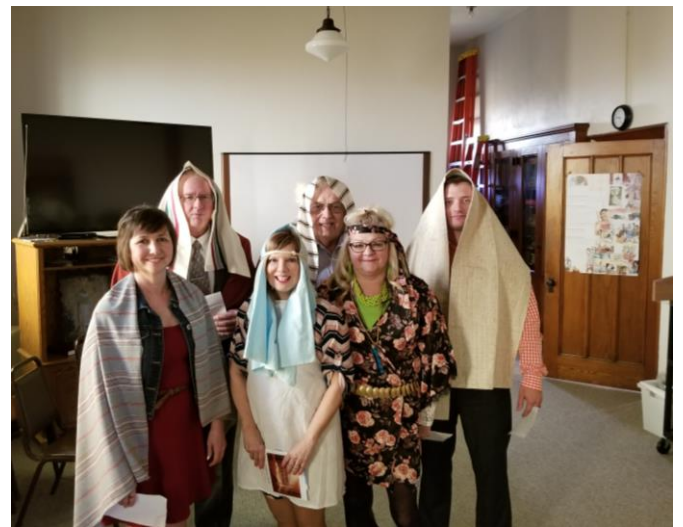
Lent Sunday Service Skit Readers