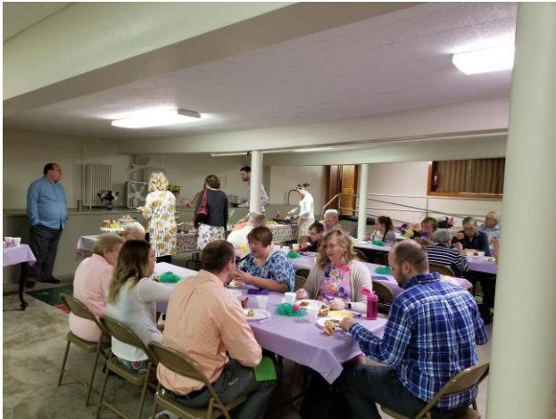
Maundy Thursday meal before the Communion Service