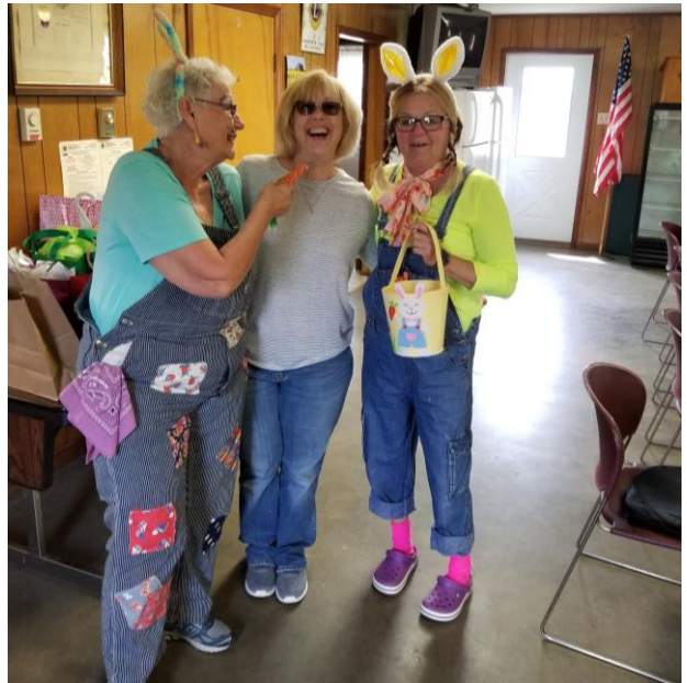
April 24 th Senior Luncheon