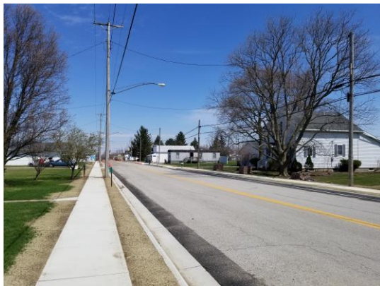
Venedocia sidewalk improvement work is almost finished