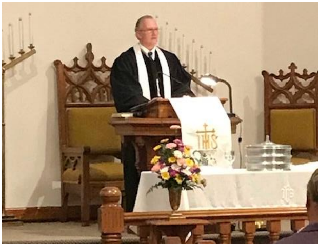
Maundy Thursday Communion