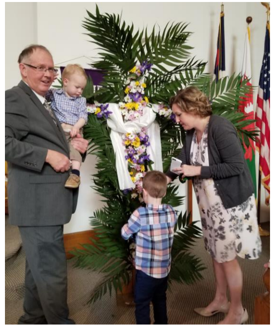
Easter Flowering of the Cross