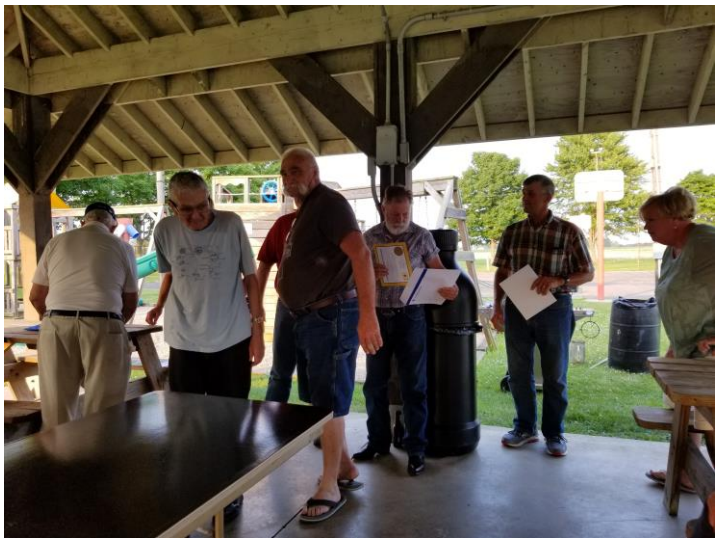
Venedocia Lion Club officer installations