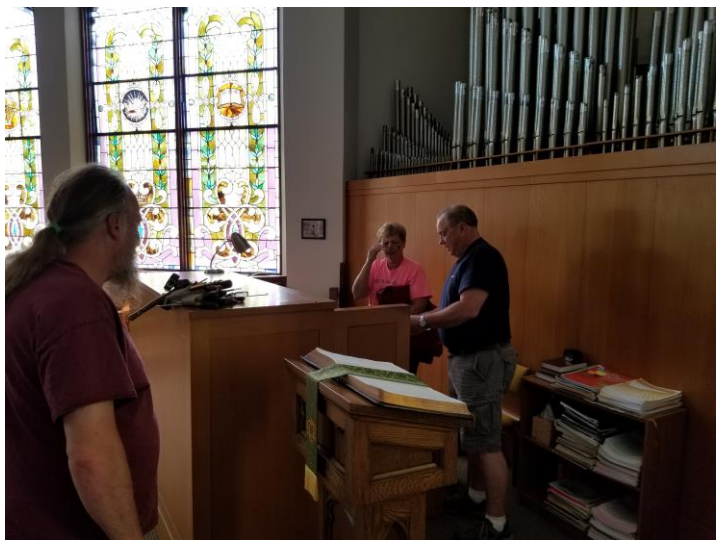
Music Committee having organ tuned for Gymanfa Ganu