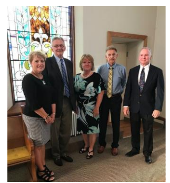
Sounds of Salem Newsletter