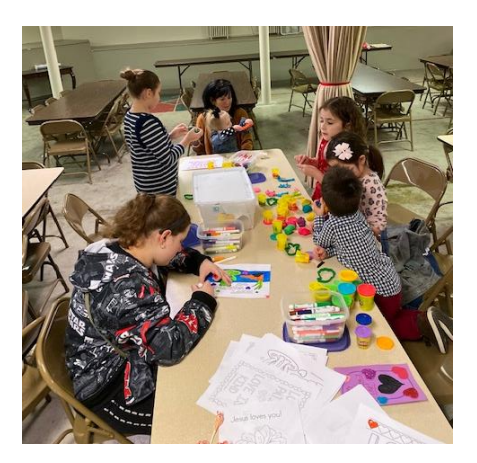
February 23 Sunday School crafts