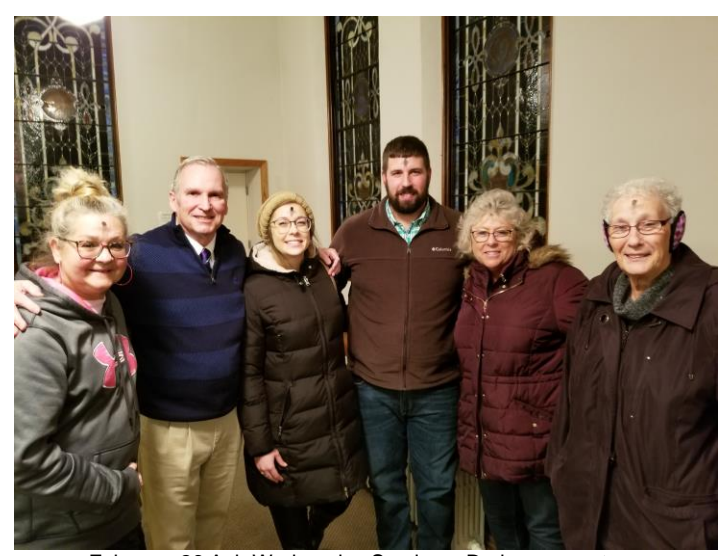
February 26 Ash Wednesday Service – During snow storm.