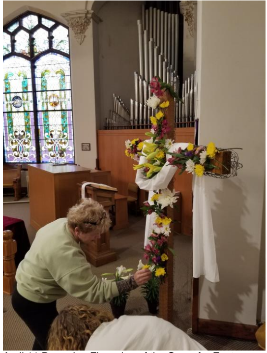
April 11 Preparing Flowering of the Cross for Easter