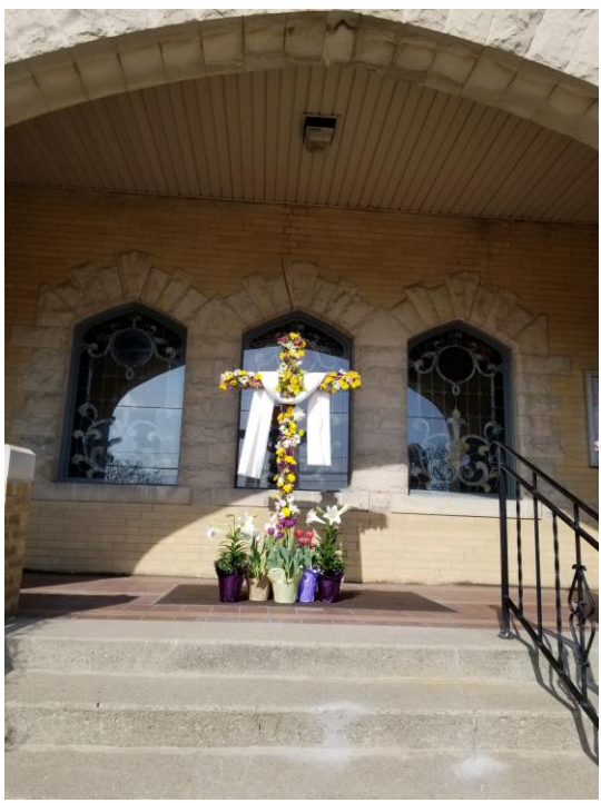
April 12 Flowered Cross for drive-by view and traditional Easter family photos