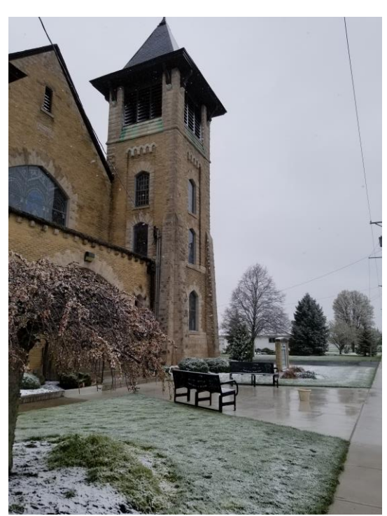
April 17 The last snowstorm falling on the spring flowers