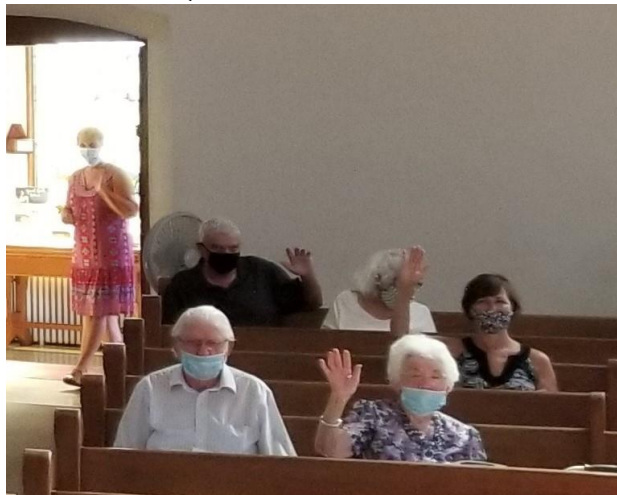
July 26 - Mask wearing and social distancing at Salem service

Salem Presbyterian Church P.O. Box 678 Venedocia, Ohio 45894