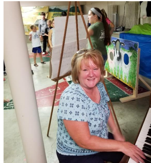
"He's got the whole world in His hand" song

Pledge of Allegiance to the American flag, to the Christian flag, and to the Bible and a talk about missions.