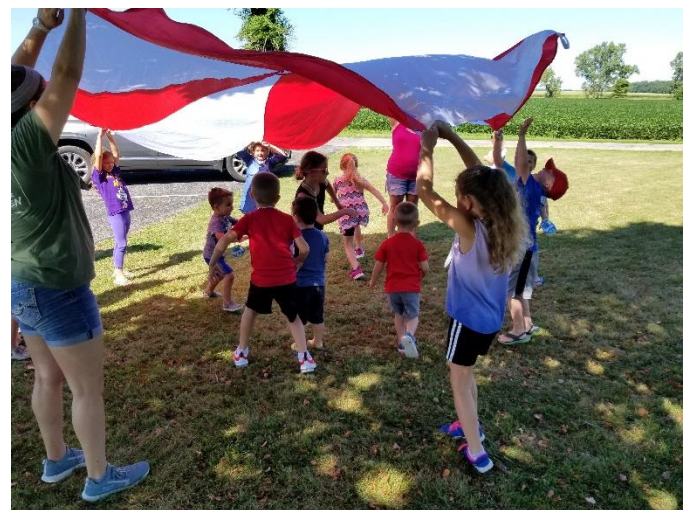
Break time for the little kids

The day's lesson: In the beginning, God created the heavens and the earth. Genesis 1:1