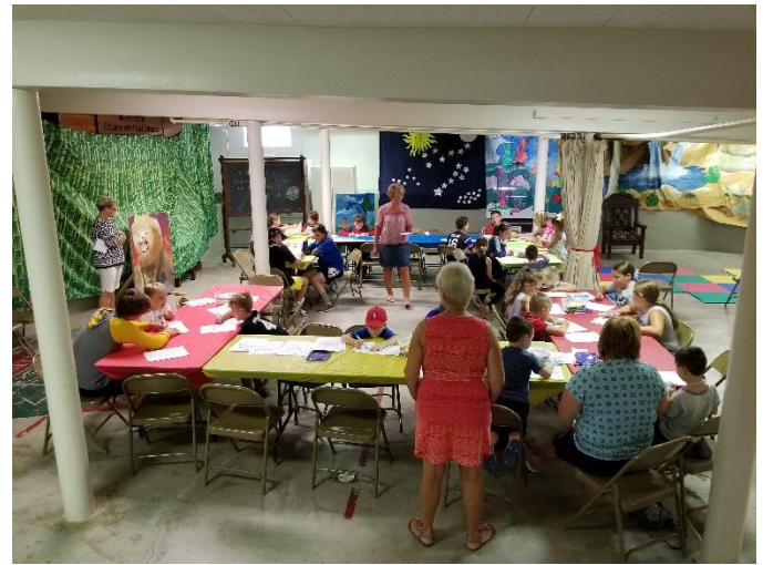
Artwork and crafts