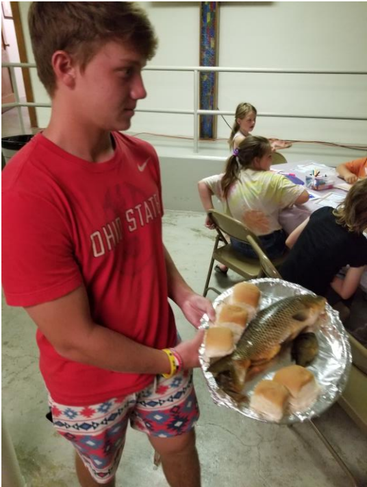
Lessons on the Miracles of the Fishes and the Loafs