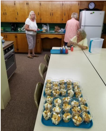
Church helpers feed the kids.