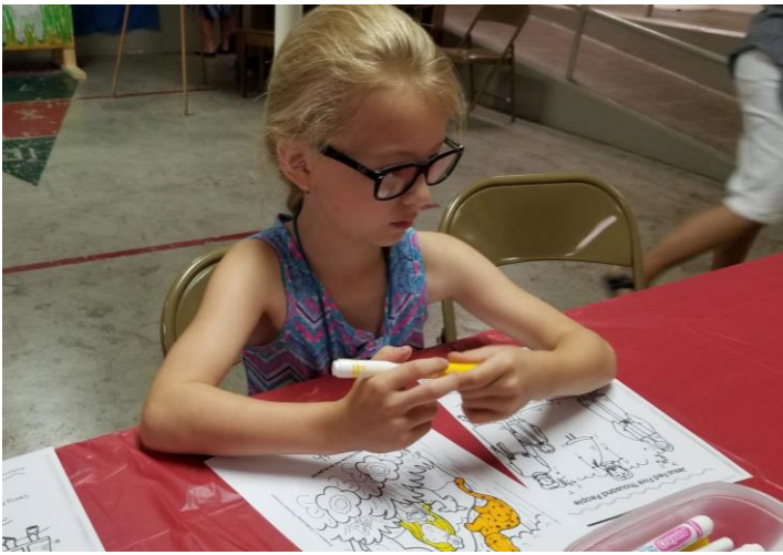
Drawing the lesson.