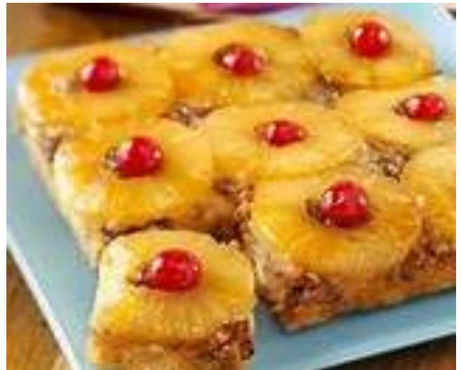
Recipe yields 12 servings