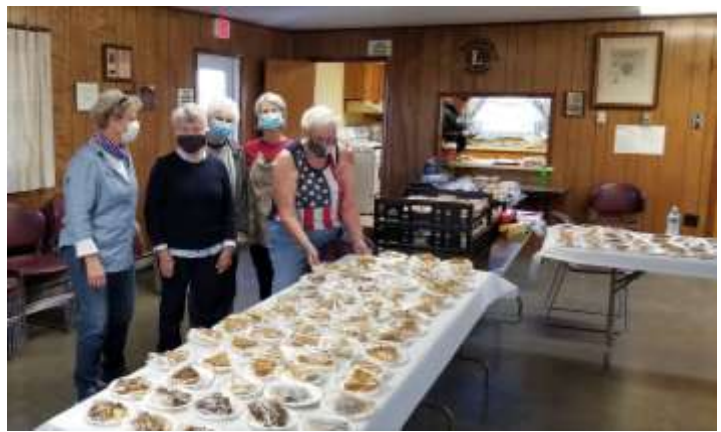
November 3<sup>rd</sup> - Some of the Election Night Supper volunteers