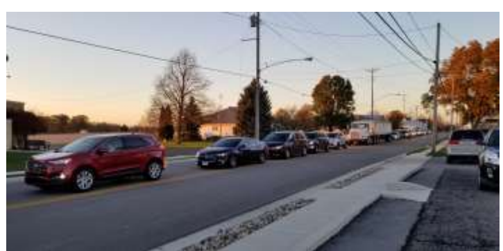
November 3<sup>rd</sup> - Cars backed up from in front of the Lions Club to past the Post Office

The Election Day Supper this past month turned out differently in many ways. First, due to Covid we were encouraged to not have indoor seating, so we decided to experiment with a drive-thru version. Well... Big THANKS to all of you who supported us and sat patiently in line it turned out to be very successful, and we did it safely. I would like to thank all of our members for their donations and all the people who helped work. It all came together; we just did not anticipate the amount of people we would have the opportunity to serve. We apologize to those who were turned away, because we ran out of food and hope they will join us next year as we already plan to do it again.