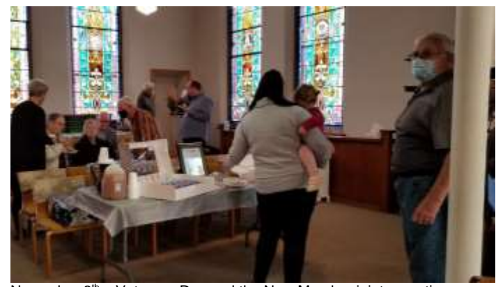
November 8<sup>th</sup> – Veterans Day and the New Member joint receptions