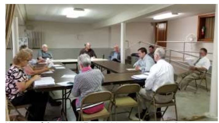
November 8<sup>th</sup> Session and Trustees joint meeting over the Budget and the Nominating Committee Reports