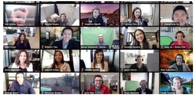
A sample Zoom video screen

Instructions will be sent by email on February 14 to those who get the newsletter by email, and it will be posted on the SalemChurch.cc website and in the Salem bulletin. You can then cut and paste the link on your electronic device. As an alternative, you can call the given phone number to listen and talk.