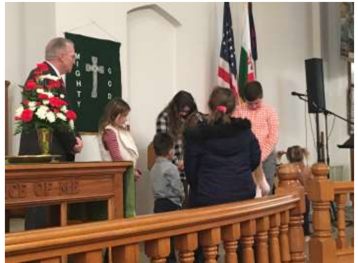
2021-01-17 Time for Children prayer