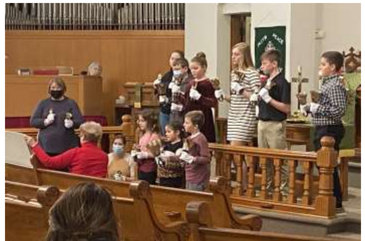
2021-01-24 Junior Bell Choir Concert