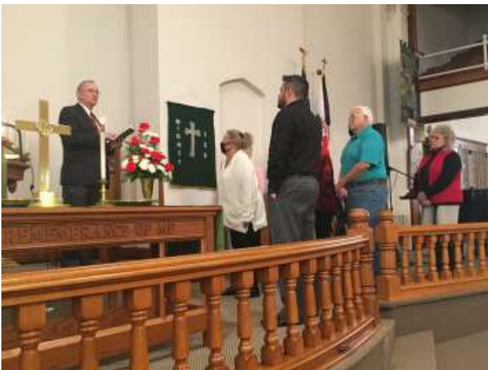
2021-01-17 Swearing in of new Session Elders