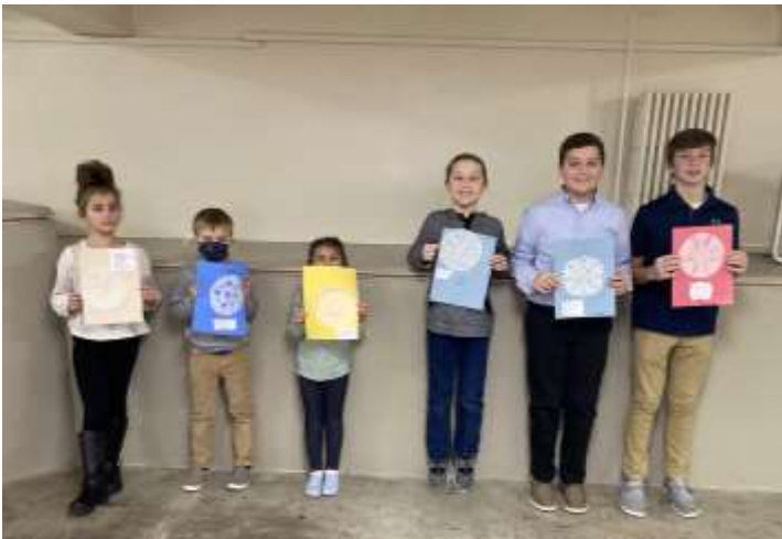
2021-01-10 Sunday School craft of snowflake lesson: "Just like the snowflakes that fall from the sky, God made me unique. I'm one of a kind."