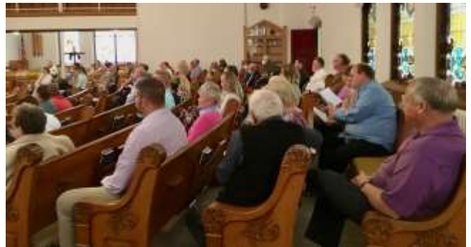
March 28, 2021 – Palm Sunday