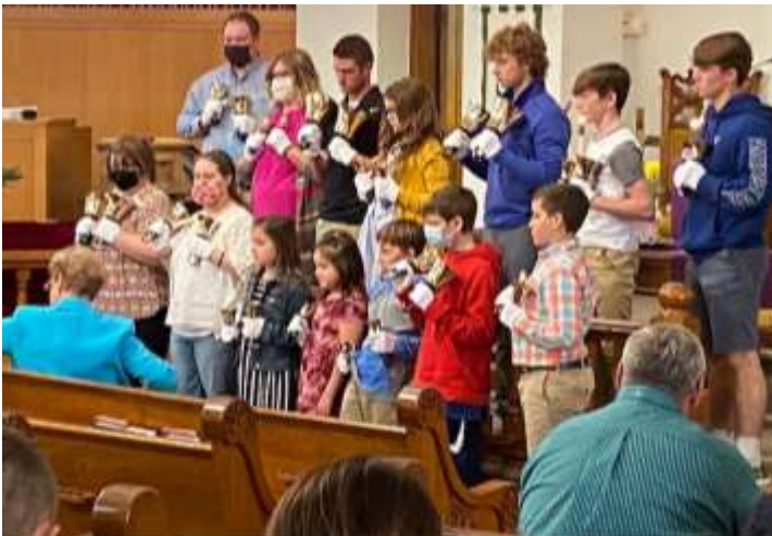
March 28, 2021 – Palm Sunday Jr. Bell Choir