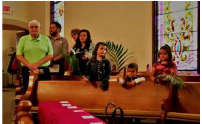
March 28, 2021 – Palm Sunday children with palms