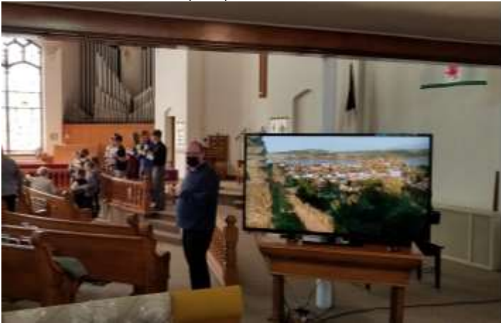
March 7, 2021 – St. David’s Day reception and Wales slide show