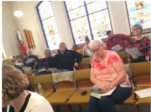
April 1, 2021 – Maundy Thursday informal reading gathering