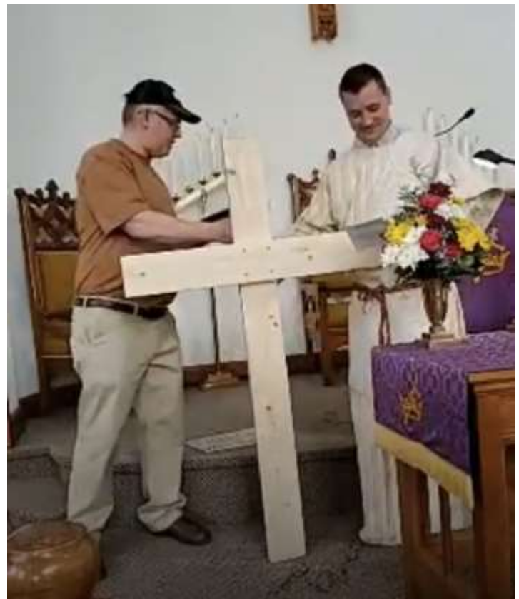
Lenten season ongoing skit and practice of, "Whose Cross Is It Anyway?"