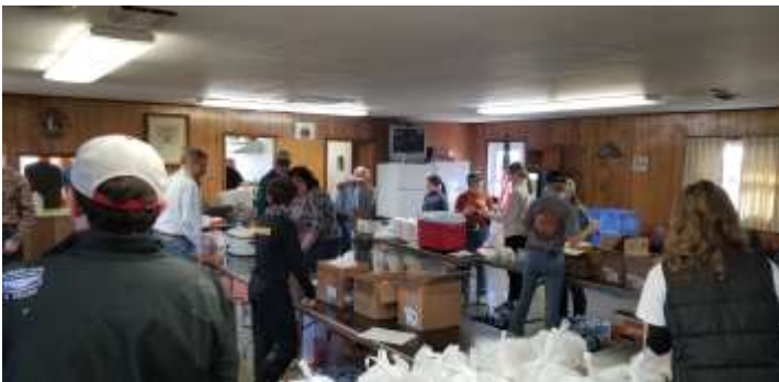
March 20, 2021 – Venedocia Lion’s Club Pancake and Sausage Drive Thru