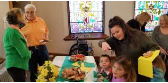
March 7, 2021 – St. David’s Day reception and Wales slide show