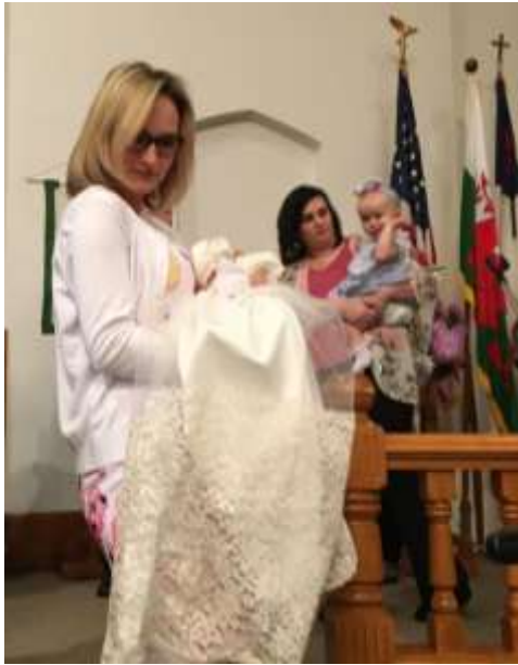
Palm Sunday Baptisms

Salem Presbyterian Church P.O. Box 678 Venedocia, Ohio 45894