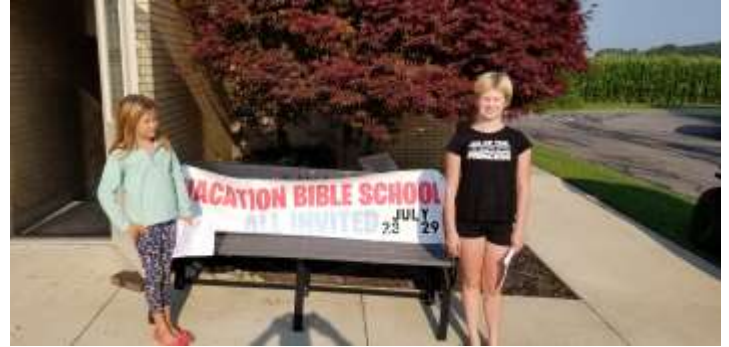
2021-07-27 VBS begins