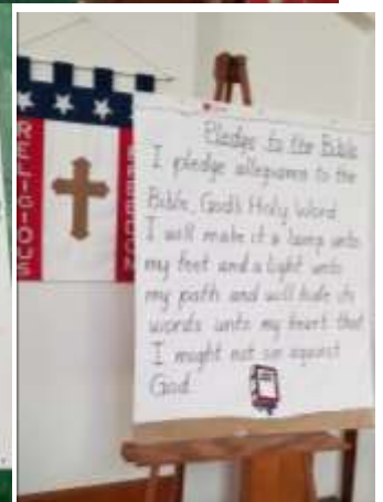
The events and the props that fascinated the kids