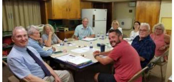
2021-07-18 Session Meeting planning summer events.