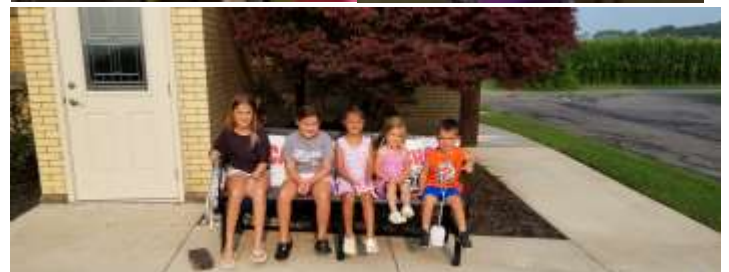
Waiting for parents afterward