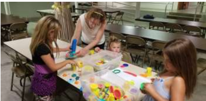
2021-08-01 Sunday school with neighborhood kids coming back after Vacation Bible School attendance.