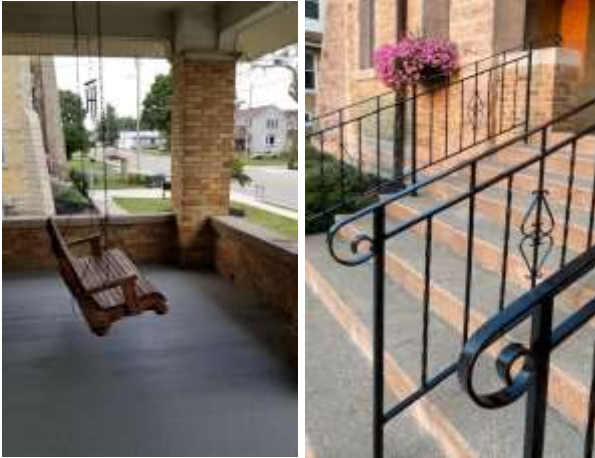
2021-08 The Trustees have been hard at work this summer painting and sprucing up Salem Church for activities.

Salem Presbyterian Church P.O. Box 678 Venedocia, Ohio 45894