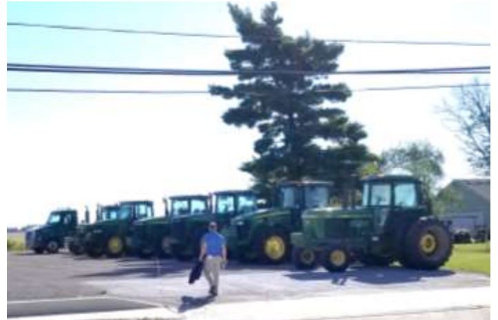
2021-09-26 Drive your Tractor to Church Sunday / Blessing of the Harvest fall event.