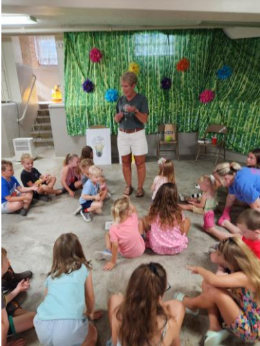
Stories and games