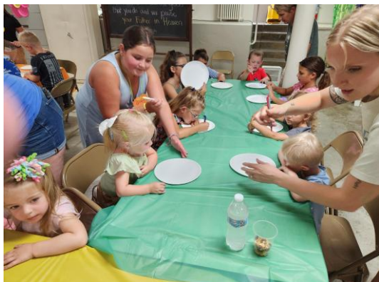
2025-07-31 Salem 2025 Vacation Bible School crafts

Salem Presbyterian Church P.O. Box 678 15240 Main Street Venedocia, Ohio 45894