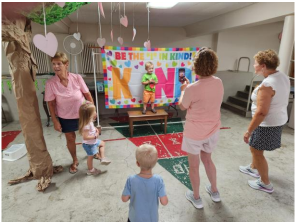
Photo time and lessons and song times