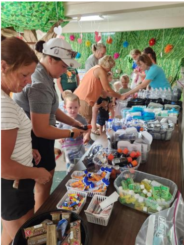
Mission Packages to Haven of Hope homeless shelter.