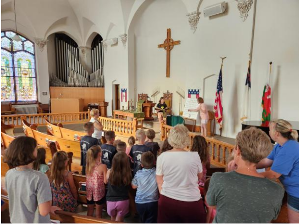
Pledges of Allegiance and Prayer time