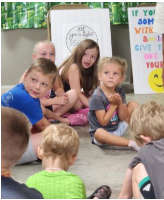
Friendship times and Bible lesson points