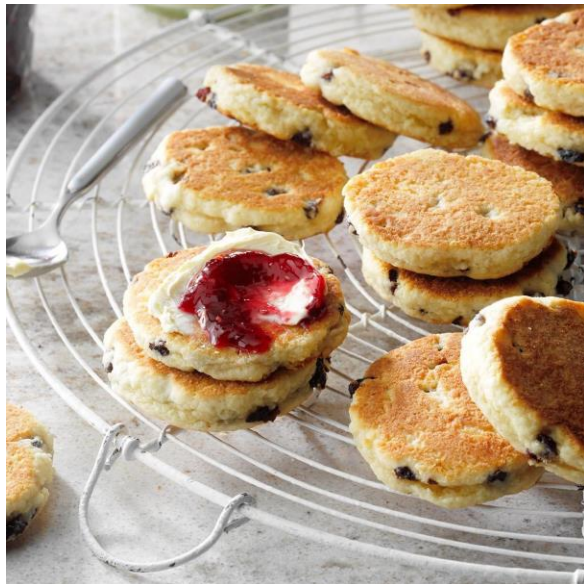
Created by the Taste of Home editorial board

medium heat. In batches, place cakes on griddle; cook until tops puff and bottoms are golden brown, 1-2 minutes. Turn; cook until second side is golden brown. Cool on wire racks.