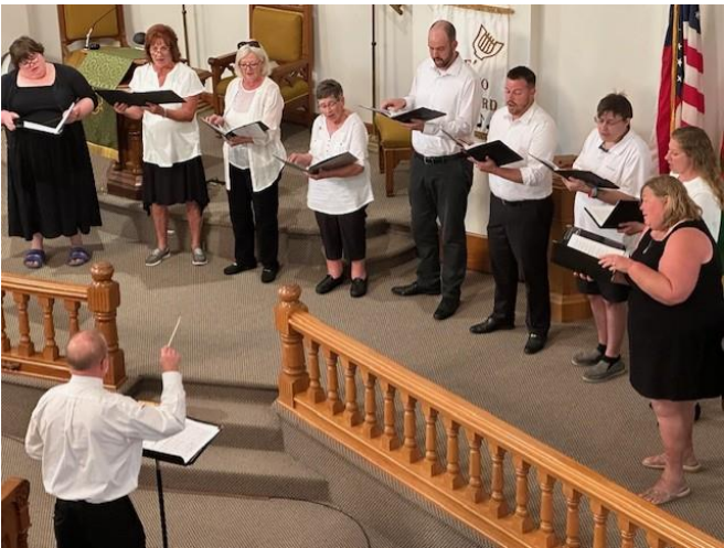
Chancel Choir from the First Presbyterian Church of Van Wert