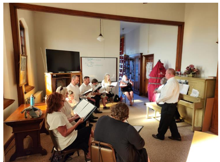
Choir practicing before the Gymanfa