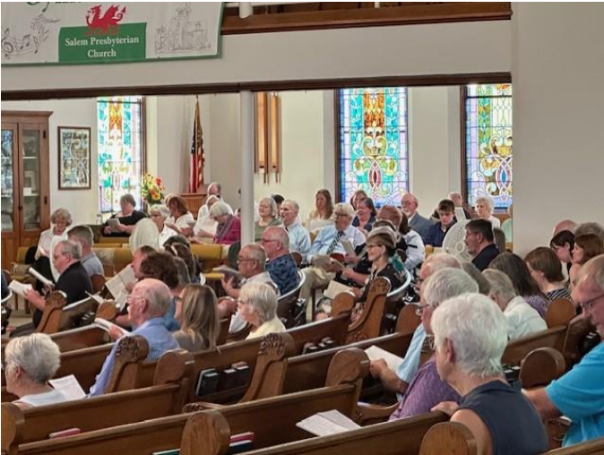
Song sections for singing